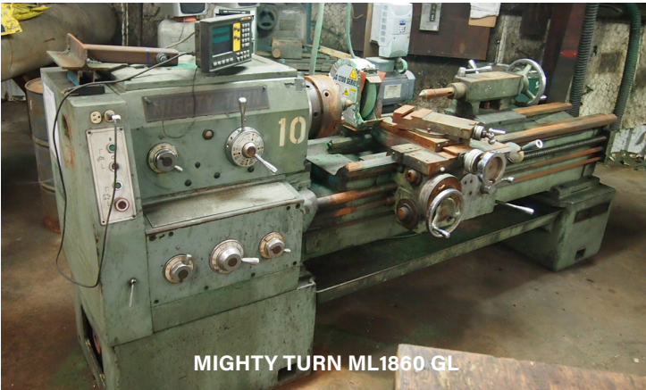
MIGHTY TURN ML1860 GL